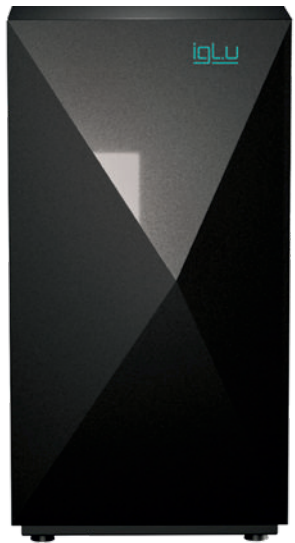
IGLU® Aleut heat pump without water heater

The IGLU Home app allows to control the device in real time, monitor the operating parameters of the heating system, electricity consumption, produced thermal energy and instantaneous efficiency factor.